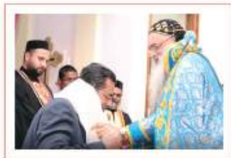
Honoured by His Holiness for exemplary contribution in the fields of business & social welfare at Hauz Khas Church, 2011