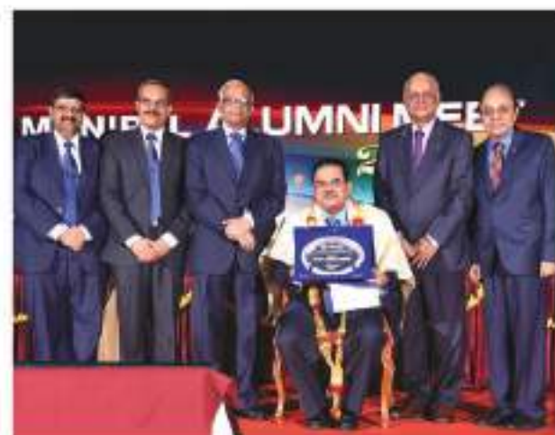
'Distinguished & Outstanding Alumnus Award', 2015 at Manipal University