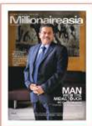
Featured on the cover page of Millionaire Asia-India Edition Magazine, 2014