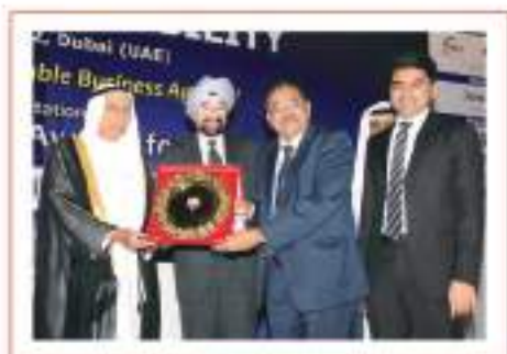
'Golden Peacock Award' for CSR' Dubai 2012