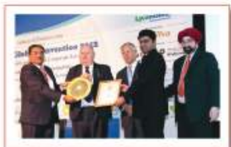
'Golden Peacock Award' for excellence in Corporate Governance, London 2012