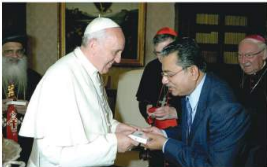
Receiving memento from Pope Francis in the Vatican City, Rome in 2014