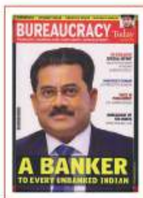
Featured on the cover page of Bureaucracy Today in its June 2013 issue