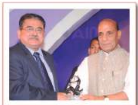
Felicitated by the former Union Minister of Home Affairs as Emerging Business Leader of the Year Awards at AIMA Management India Awards, 2014