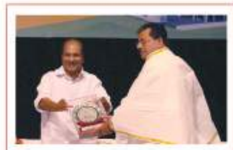
Felicitated by the former Defence Minister of India, in recognition of phenomenal success in business, trade and social work