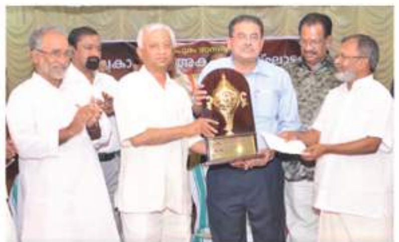
Receiving the "Athura Seva Rathnam Award" instituted by Gandhi Bhavan International Trust