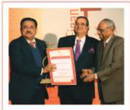
SKOCH Financial Inclusion Award at New Delhi, 2013