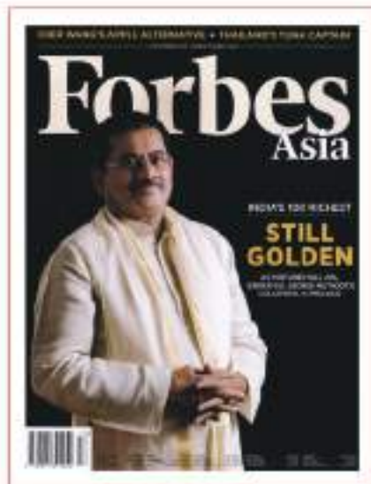
Featured on the cover page of Forbes Asia, November 2011 issue