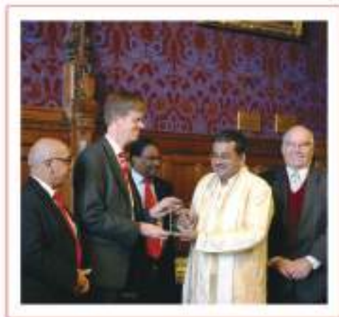
'Asian Businessman of the Year Award' at House of Commons, British Parliament, London 2011